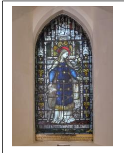
St Agnes. Memorial to Mildred Spurling, died 1902 aged 15.

Stained Glass Windows The Stained glass in the three windows in the Sanctuary is by Clayton and Bell and was installed in 1902. The windows survived the 2015 fire.