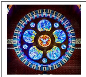
Devotion - In the centre is the dove, a symbol of The Holy Spirit, peace, love and devotion. The five large panels represent water and air. Water within the Christian faith is a metaphor for divine wisdom. Here it also represents Fleet Pond, showing geese in flight in the top panel and fish in the bottom two panels.