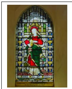
St Mary of Bethany. Memorial to Grace Claire Oakley, died 1895, aged 14.

Memorial Windows The two windows on the South wall of the Chancel were restored and reinstated following the 2015 fire. The windows had been removed from their position on the North wall when the Lady Chapel was built in 1958 and stored above the choir vestry.